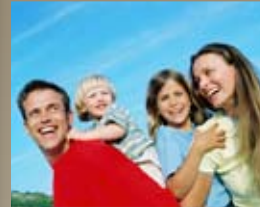
10" x 8"