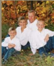
8" x 10"