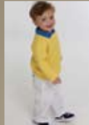
5" x 7"