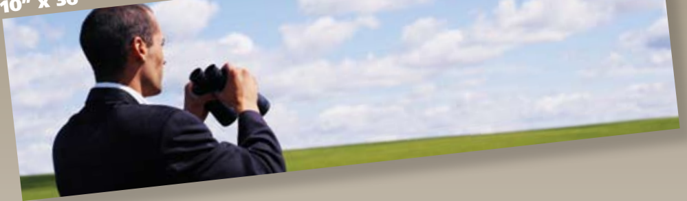
10" x 36"