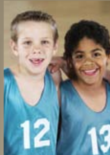
8" x 12"