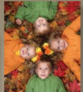
10" x 12"